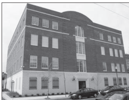
CANAL BANKS BUILDING