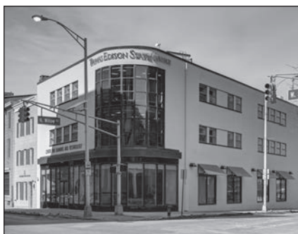
CENTER FOR LEARNING AND TECHNOLOGY