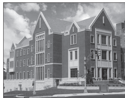
GEORGE A. PRUITT HALL