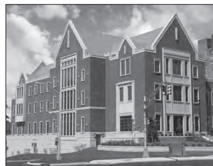
GLEN CAIRN HALL