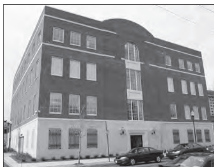
CANAL BANKS BUILDING